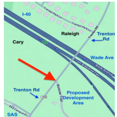
Red arrow points to proposed development area near the SAS entrance on Trenton Road near I-40

Let's work together to preserve safety and quality of life in the corridor!