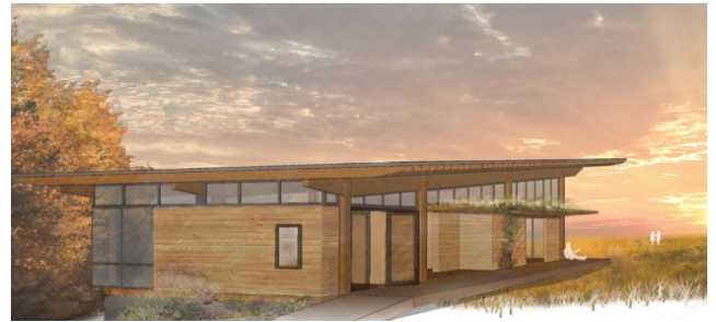
Proposed Education Center Design

Prairie Ridge Ecostation will be temporarily closed to public visitation during construction, which is anticipated to last until 2027. While general access will pause, the site will remain active with small registration-based programs, scientific research and collaborations, and ongoing stewardship of its 45-acre landscape.